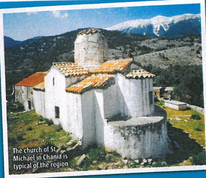
The church of St. Michael in Chania is typical of the region