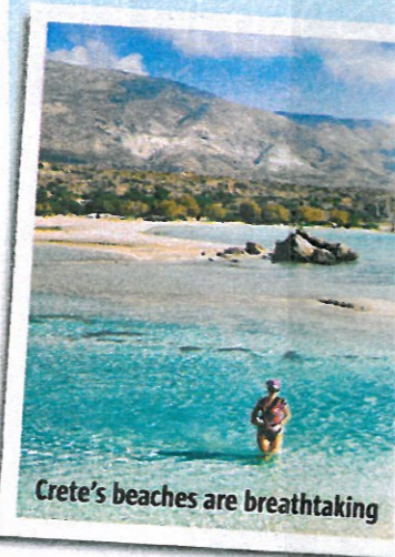
Crete's beaches are breathtaking

There are long, soft sandy ones, ones covered in coloured pebbles, deserted coves, beautiful bays — all with clean, crystalline waters. Platanias is a long, sandy beach in a picturesque resort close to Chania. If you want something remote, head for Finikas on the south coast, accessible only on foot from