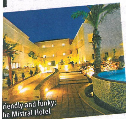
Friendly and funky: the Mistral Hotel

Crete is the most southerly island in Greece, and Chania is as close to north Africa as it is to Athens. Not surprisingly, the weather is pretty good. Summer can start in April and stretch into October. When I visited in September, the daytime temperatures were still well in the 30°s.