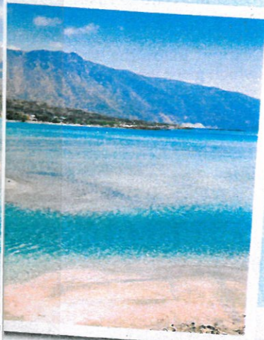
The tranquil beauty of Sfinari

Maleme Beach is a few minutes' walk if you stay at the Mistral. Falasarna has loungers for hire on a long pretty beach, a small taverna and the ruins of a city dating from 300BC. Most astonishingly, the world's first computer, the Antikythera mechanism, was found here in a wrecked ship. It had bronze gears and was housed in a wooden box.