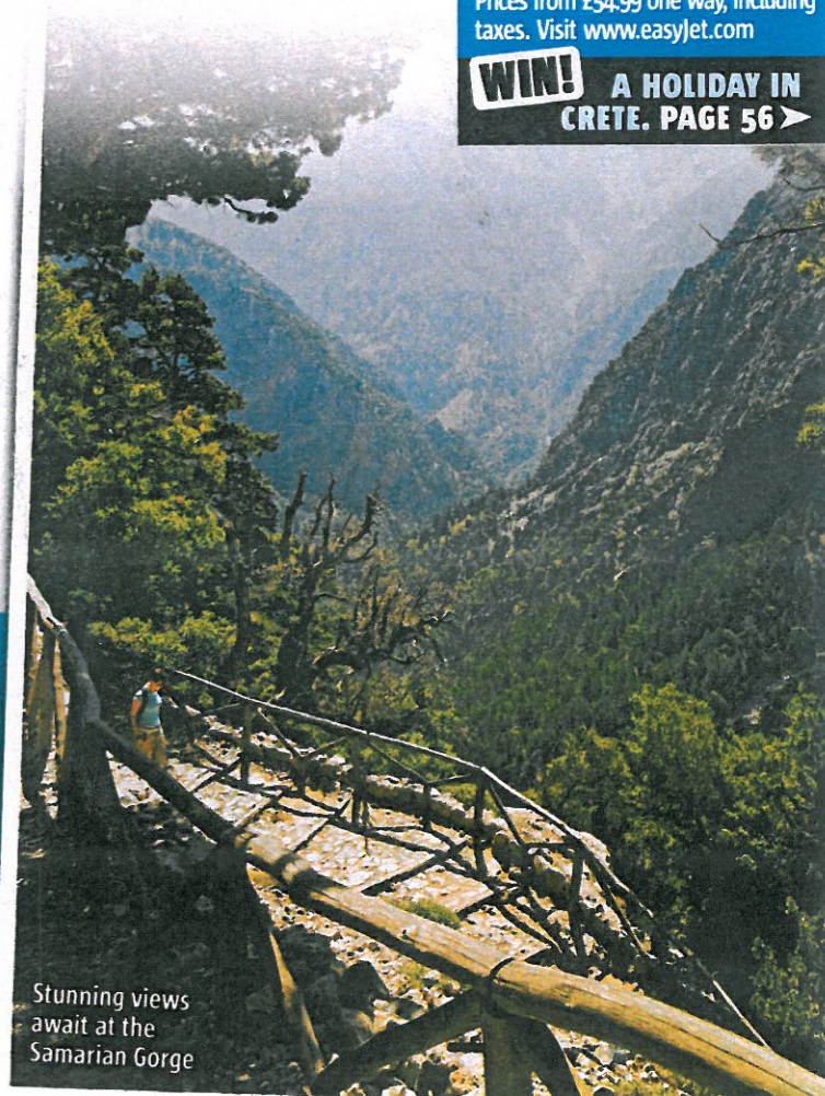
Stunning views await at the Samaritan Gorge

Homemade herb bread, aubergines, peppers and salads straight from the garden were brought out in abundance. Here you eat like a Greek — you feast, you talk, you chill.